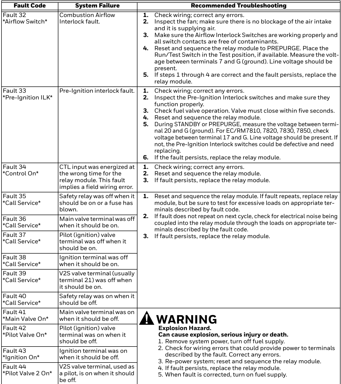
Table 3. Hold and Fault Message Summary. (Continued)